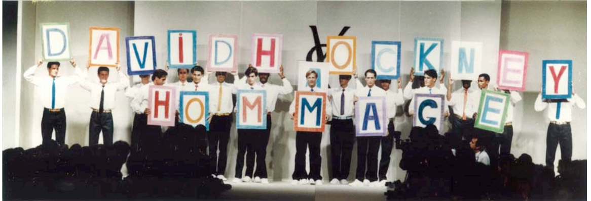
Photo all rights reserved. Yves Saint Laurent Rive Gauche show (ready-to-wear). Paris, 1987

Pierre Bergé added, “it is fitting that the artists’ longtime friendship and shared love for the natural world will combine to be seen in Paris—a city that is justly renowned for its beautiful gardens and abundant floral displays.” David Hockney lived in Paris from 1973-75, and this will be the first major exhibition devoted to his work in the city in more than a decade, when he took over the south gallery of the Musée national d’art moderne - Centre Georges Pompidou with David Hockney, Espace, Paysage (1999). The major retrospective exhibition of 164 paintings and photocollages was exhibited simultaneously with David Hockney: Dialogue avec Picasso at the Musée Picasso. Other exhibitions of Hockney’s work in Paris include David Hockney: Retrospective Photoworks at the Maison Européenne de la Photographie (1999); David Hockney Photographe , at the Centre Pompidou (1982); and David Hockney: Tableaux et Dessins , at the Musée des Arts Décoratifs (1974).