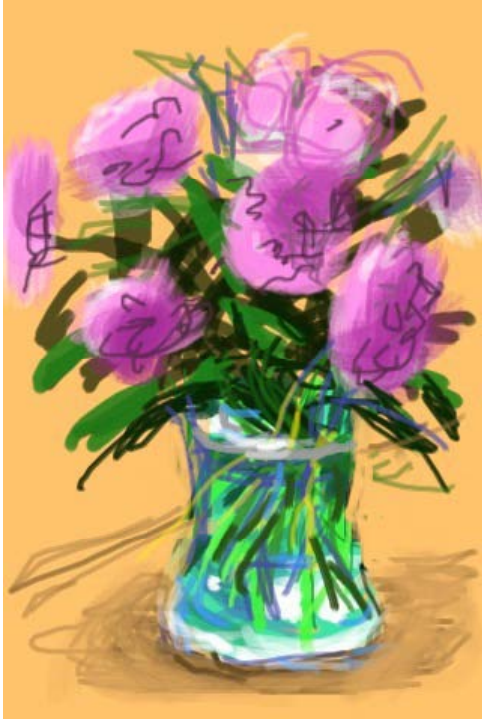
David Hockney, Untitled , 2009 iPhone drawing © David Hockney